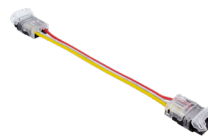
HD Linking Cable (IP54) TL-4JUMP6-HD (6") TL-4JUMP24-HD (24")