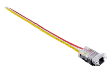
HD Power Feed (IP54) TL-4PWR-HD