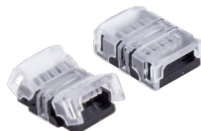
HD Splice (IP54) TL-4SPL-HD